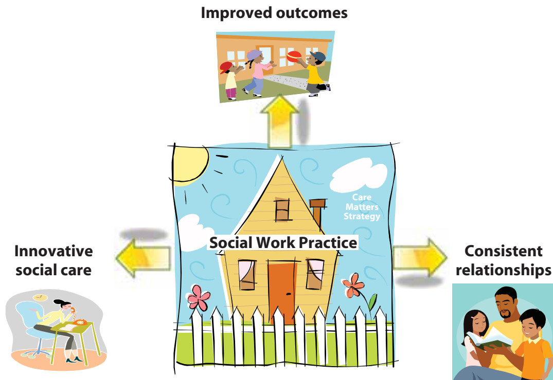
Figure 2: Objectives of a Social Work Practice

There are three models proposed for the Social Work Practices pilots: a professional model run by qualified and registered social workers; a third sector model run by a third sector organisation; and a private sector model.