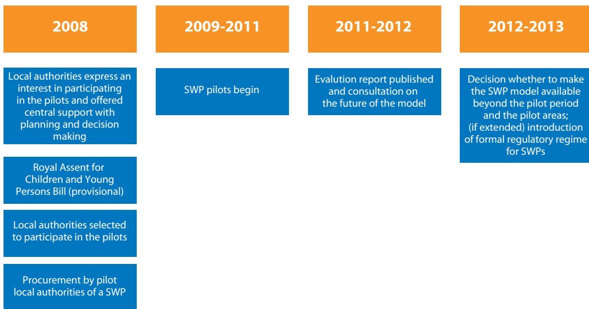
Figure 1: High-level timescales for the Social Work Practices Pilots

If you are interested in applying to pilot the Social Work Practice model, please see the Statement of Interest form at the back of this document.